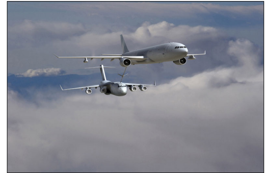
NORTHROP GRUMMAN/EADS KC-30