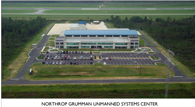
NORTHROP GRUMMAN UNMANNED SYSTEMS CENTER