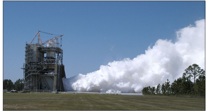
A-1 TEST STAND

Division: Pratt & Whitney Rocketdyne, Canoga Park, CA